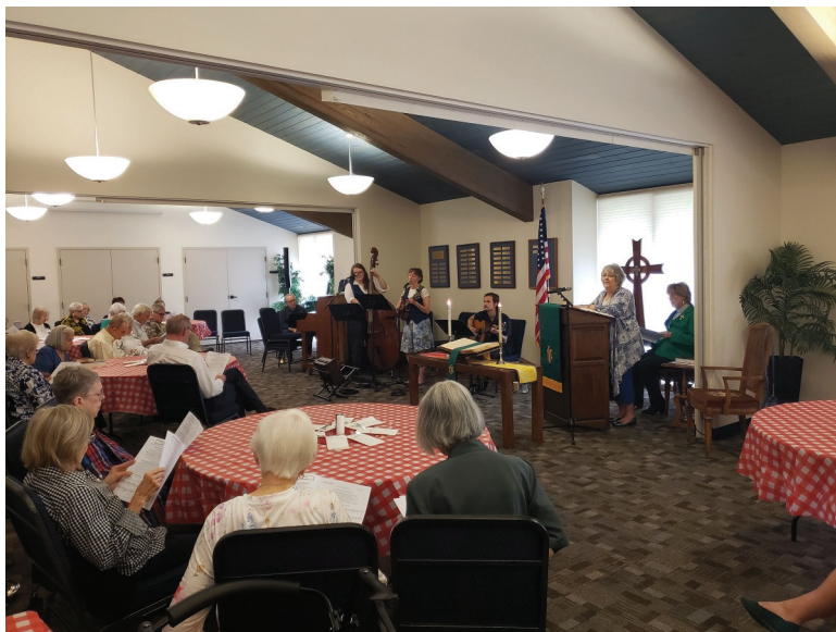
Top: Singing along with Blue Grassfire during Sunday Worship service